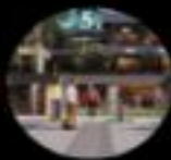
2400 M2 CENTRAL PLAZA