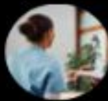
STAND-ALONE MEDICAL BUILDINGS