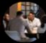
STAND-ALONE ADMINISTRATIVE BUILDINGS