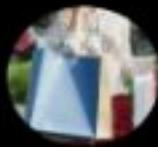
RETAIL AND COMMERCIAL AREA