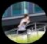
OUTDOOR FITNESS AREA